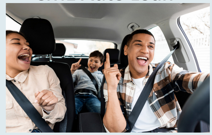
Looking to finance a new or used vehicle?

CME Credit Union offers low rates, flexible terms and quick approvals to make your car-buying experience hassle-free.